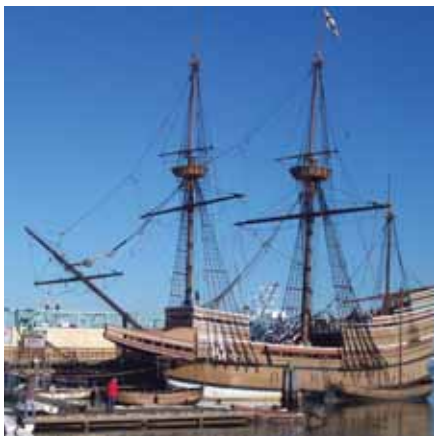
Replica of the Mayflower in Plymouth Rock

Cape Cod's small-town character and charm comes from the 15 towns that make up the area.