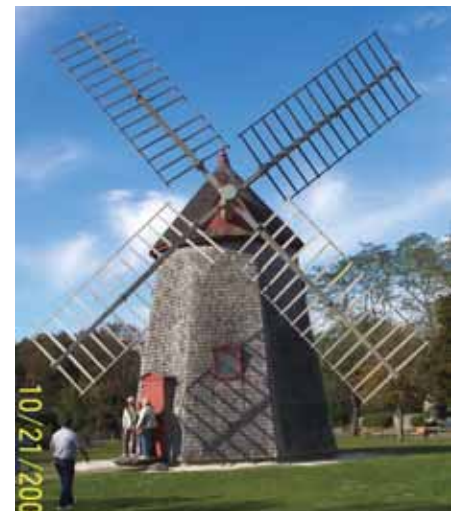
Windmill in Cape Cod.

Our trip also included visits to some significant historic sites nearby, including Plymouth Rock in Plymouth, Mass. For those who may be wondering, Plymouth Rock is just that – a rock. While in Plymouth, we boarded the Mayflower II, a full-scale reproduction of the ship that crossed the Atlantic in 1620.